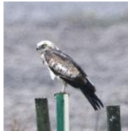
Short-toed Eagle: Donana