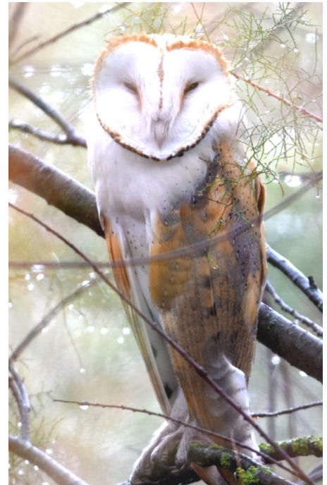
Barn Owl : Donana