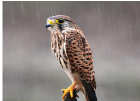
Common Kestrel getting drenched in the rain