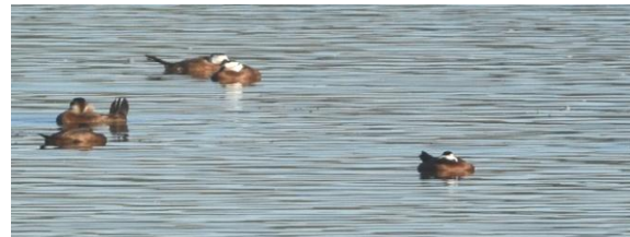
White - headed Duck: Laguna de Medina

Arriving at the hide, sighted high above the Laguna which gave a panoramic view of the water, we immediately saw Comghal's first 'Lifer' of the trip, White-headed Duck - a flock of 30 birds. Also to be seen were Black-necked Grebe , Ferruginous Duck , Gadwall , Red-crested Pochards , Cattle Egrets , Little Egrets , Grey Herons and a solitary juvenile Greater Flamingo , the first of many. Also observed was our one and only Common Kingfisher . As we walked back Linnet , Serin , Zitting Cisticola , Greenfinch , Great Tit , Penduline Tit , Great Crested Grebe , Buzzard , Little Grebe , Eurasian Coot , Moorhen , Sparrowhawk , Red-legged Partridge , Shoveler , Common Pochard , Black-winged Stilt , Jackdaw and White Wagtail .