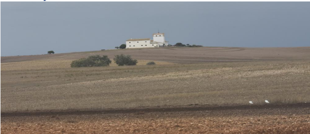
Cortijo at Osuna with a traditional landscape, favoured by the Great Bustards, sadly now being turned into Olive Groves