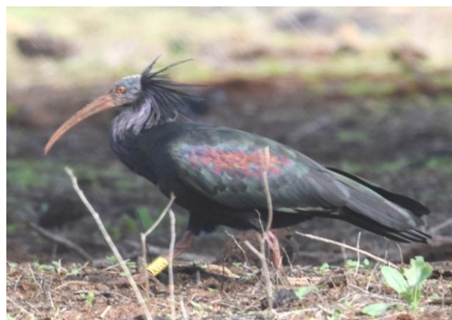
Bald Ibis : Vejer de la Frontera

The Laguna proved a rewarding first stop and so we left anticipating our next target bird, one of the rarest in Europe and hopefully Comghal's second 'lifer' of the trip. To see the bird we travelled south to the town of Vejer de la Frontera and began with a search of a golf course in the area where they had been reported to be present a few days earlier. After an extensive search around the area we found three of the birds near a municipal dump, the iconic Bald Ibis . It won't win a beauty contest but the fact it has survived is a testament to all those involved in its recovery programme in Spain. It's looks are not one the general public would warm to but they [birds] can't be all as stunning as the bee-eater family.