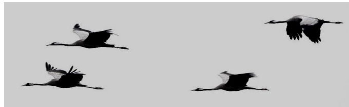
Cranes flying in Donana