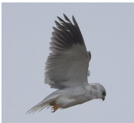
Black-winged Kite in Donana