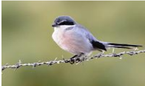
Iberian Grey Shrike

A small pond area produced Coot, Little Grebe, Green Sandpiper, Common Snipe, White Stork, Cattle Egret, Little Egret, Marsh Harrier, Red-legged Partridge, Mallard, Lesser Black-backed Gull, Black-headed Gull, and then we headed for an old Cortijo [in ruins] as the sky began to darken with the rain clouds approaching. Along the way we saw Spanish and House Sparrows, a Dartford Warbler [great spot by Vicent] hiding in some undergrowth; also seen were a flock of Calandra Lark, Stone Curlew, Skylark, Merlin, Kestrel, Sand