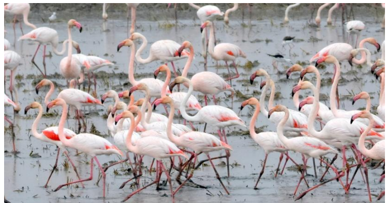
Greater Flamingo at Isla Major rice fields

We drove southeast out of Seville on the A-8053 and we started birding around the rice fields near Isla Major . Highlights were Greater Flamingo, Glossy Ibis, White Stork, Black Stork, Greenshank, Pied Avocets, Great White Egrets, Common Snipe, Black-winged Stilt, Lesser Black-backed Gull, Yellow-legged Gull, Green Sandpiper, Cattle Egret, Little Egret and some unidentified waders which looked like Ruff.