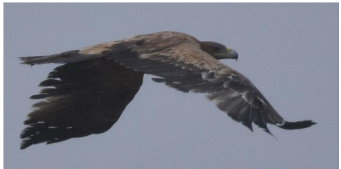
Juvenile Spanish Imperial Eagle: Donana