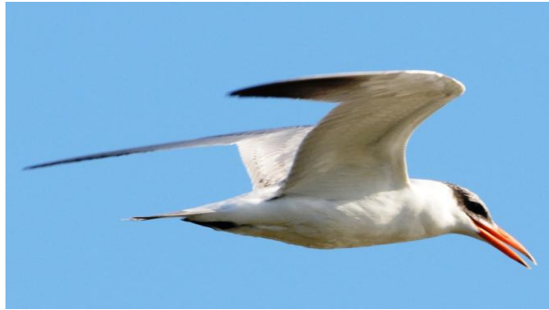
Caspian Tern at La Algaída