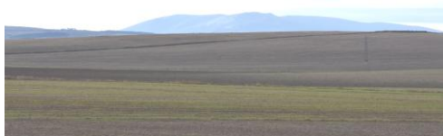
Remnant Steppe: Campina de Osuna