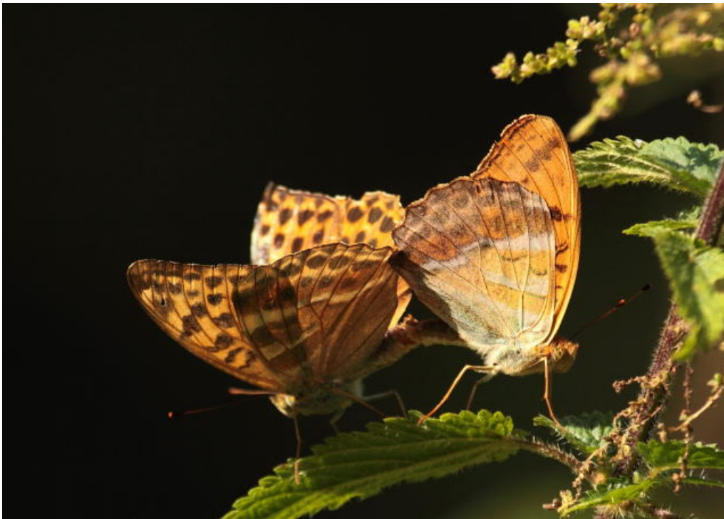
Silver Washed Fritillary