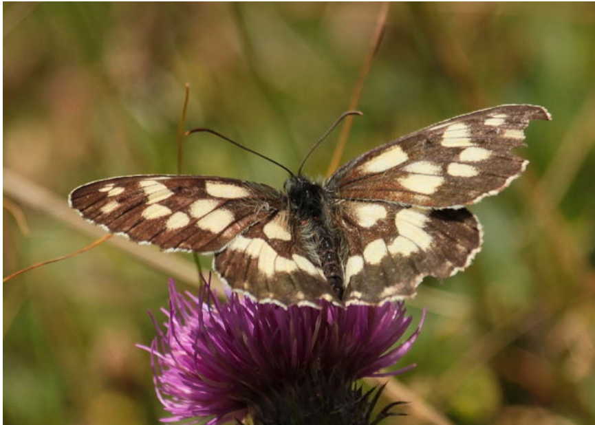
Marbled White (f.procida)