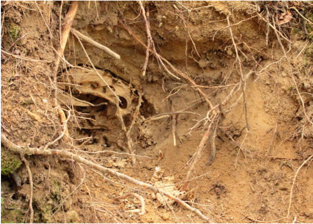
Wasp nest ravaged by Bear