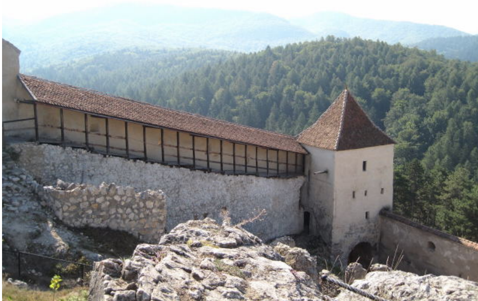
View from inside Rasnov Castle

Forget your perceived ideas about Romania; it is a truly beautiful country with about a third covered in forest. Full of unspoilt countryside, charming villages and a rural way of life, it is how Britain would have been 50 years ago. On our trip we visited five castles/citadels as well as some of the finest medieval cities in Europe including Brasov and Sighisoara. Romanian people we found pleasant and friendly, interestingly most younger people under around 35 spoke fluent English as it is taught in all schools. It was noticeable that they were very family oriented with many families with teenagers in tow, out together as a unit. Forget the vision of Romanians in Park Lane, these are Gypsies who are a minority and are viewed by ordinary Romanians the same as we do in the UK.