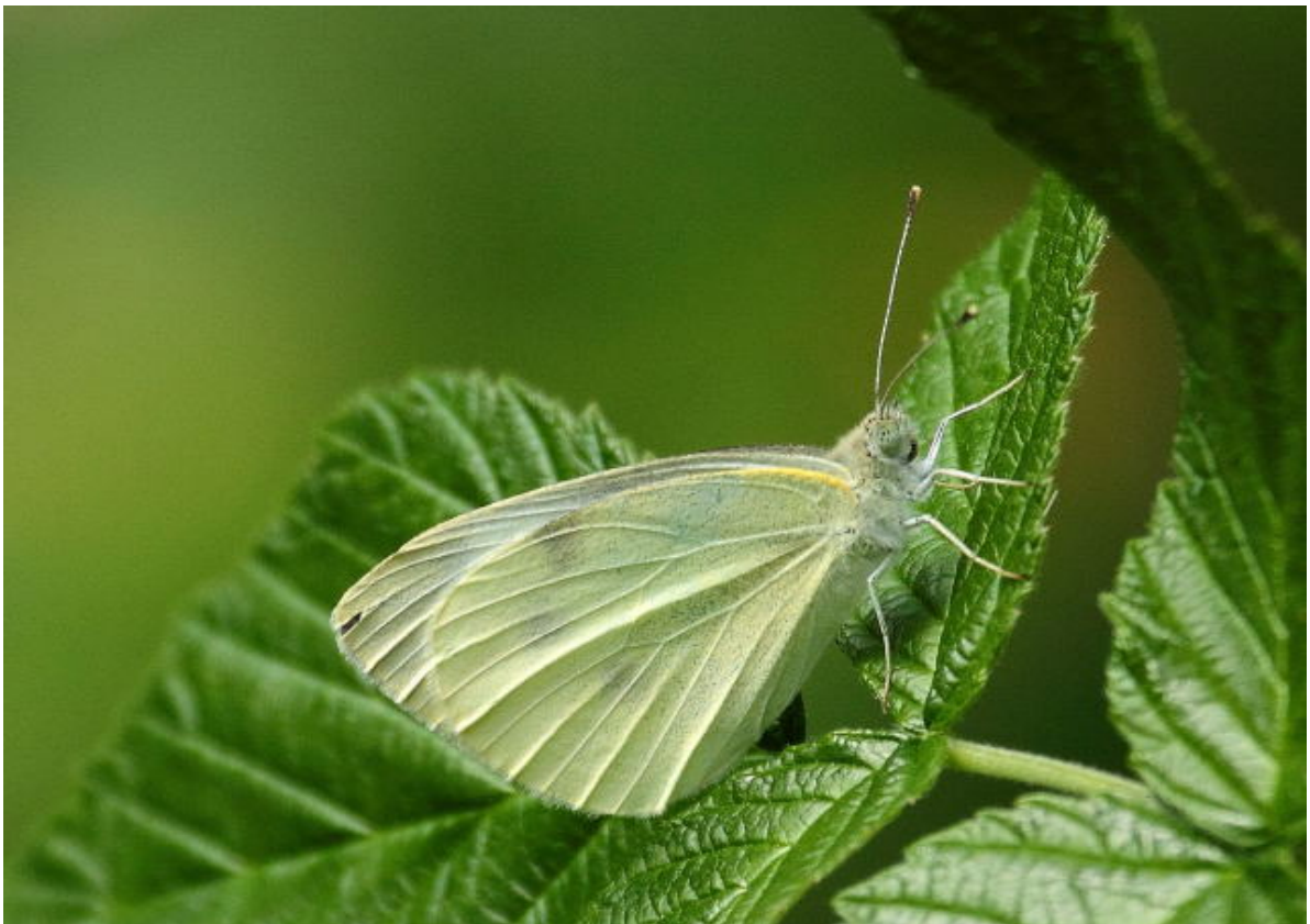
Mountain Small White

A good variety of butterflies were seen in most locations:- Large White, Mountain Small White, Marbled White ( f. procida ), Swallowtail, Common Glider, Small Heath, Common Blue, Red Admiral, White Admiral, Comma, Wall Brown, Dusky Meadow Brown, Peacock, Small Tortoiseshell, Painted Lady, Large Skipper, Dingy Skipper, Large Ringlet, Dewy Ringlet, Sudeten Ringlet Mountain Ringlet, Ringlet, Arran Brown, Clouded Yellow, Silver Washed Fritillary, High Brown Fritillary, Queen of Spain Fritillary, Purple Emperor.