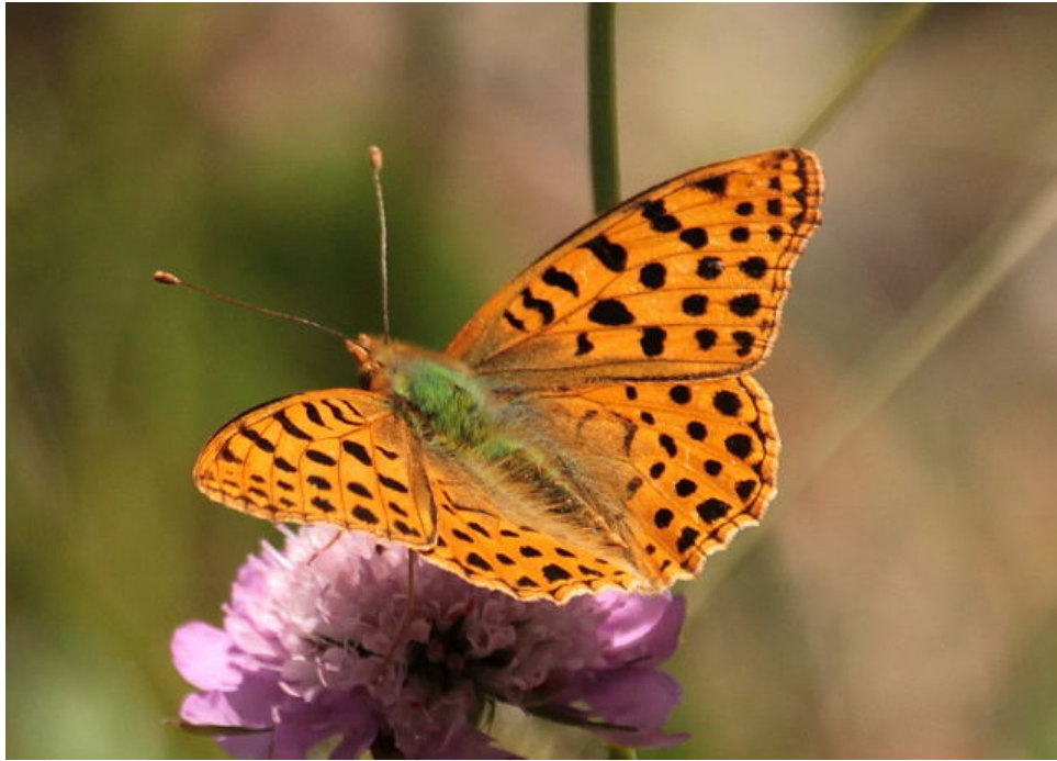
Queen of Spain Fritillary