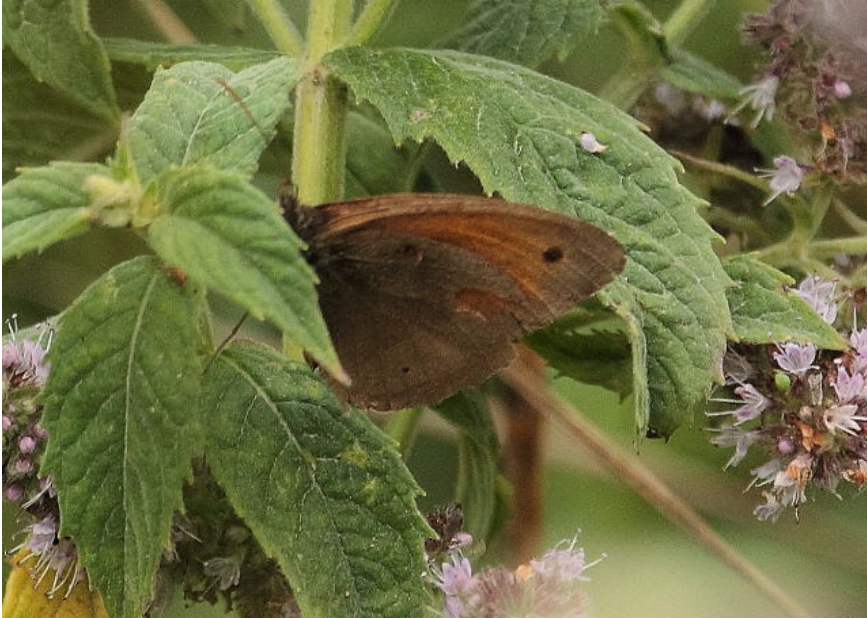
Probable Dewy Ringlet