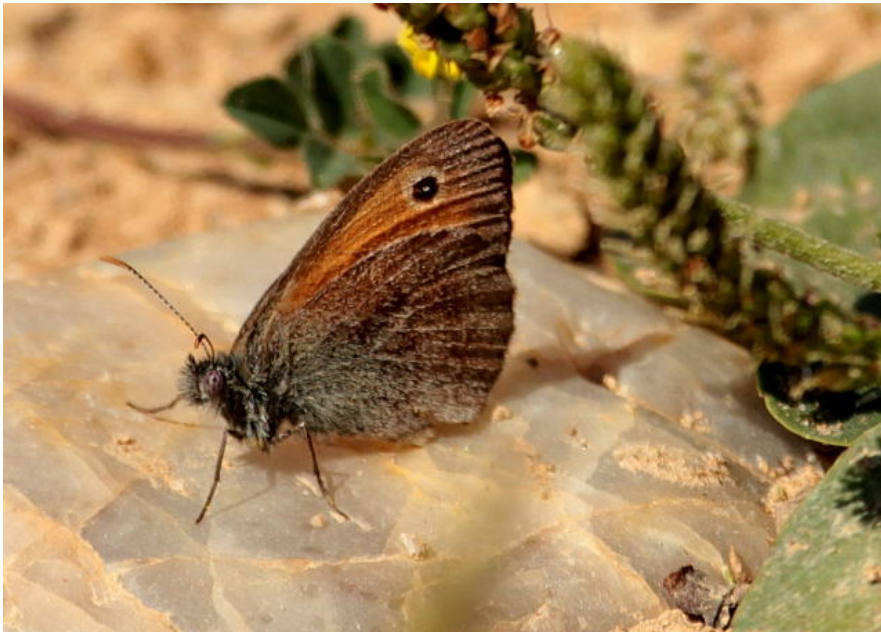
Dusky Meadow Brown